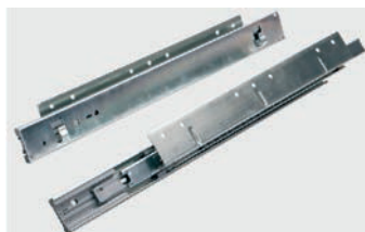
Corrediça com amortecimento